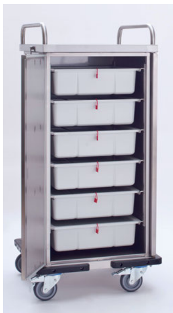
131300 with Endoboxes/ lids/seals