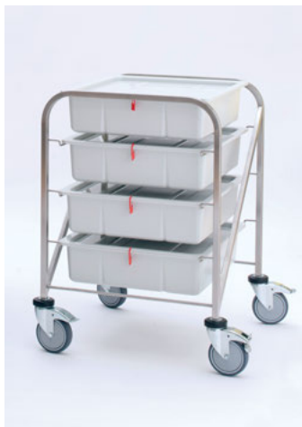
131152 with Endoboxes/ lids/seals