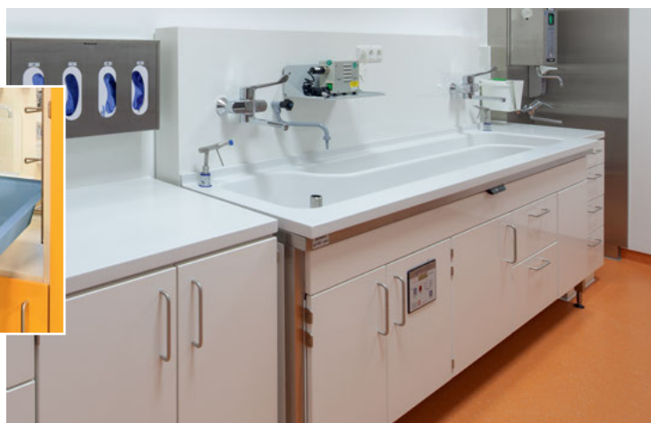
Endoscope reprocessing station, height- adjustable, with dosing device and Magnes accessories