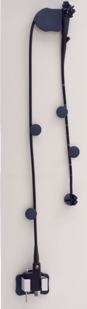
Magnetic endoscope holder (EBS 8-C.51)